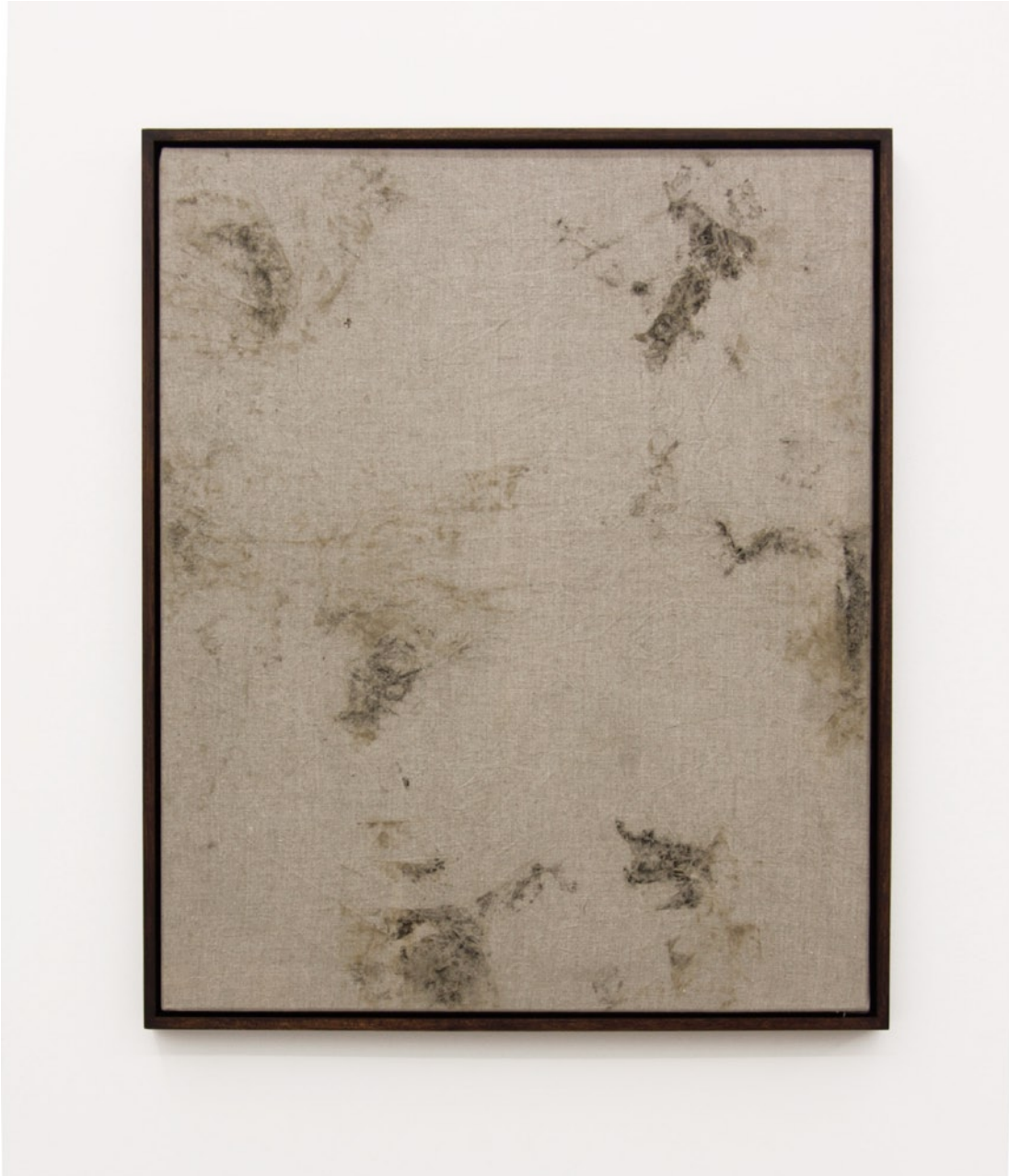
Davide Balula River Paintings, East River 2009 Sediments on canvas 76 x 73 cm Unique