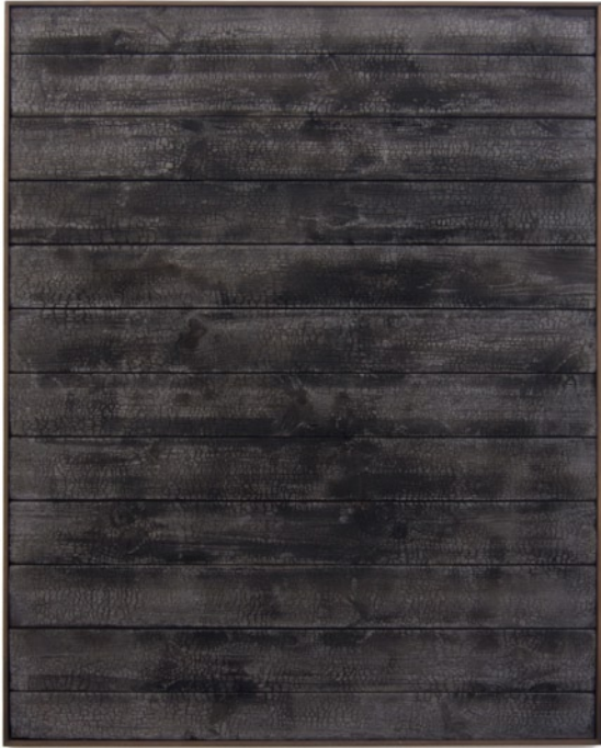
Davide Balula Burnt Painting (Portrait) 2010 Charred wood 160 x 124 cm Diptych