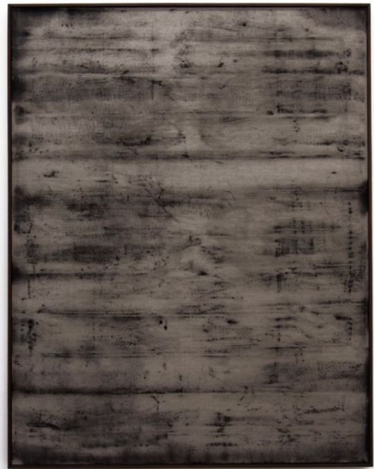
Davide Balula Imprint of the Burnt Painting (Portrait) 2010 Dust of charred wood on canvas 160 x 130 cm Diptych