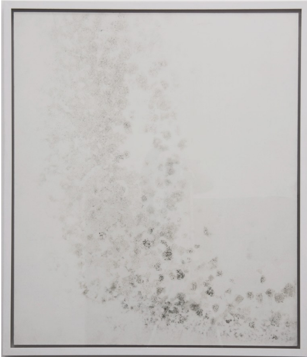
Davide Balula Mold Painting 2009 Mold on painted board 100 x 80 cm Unique