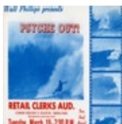
Psyche out! 1962 Vintage surfing movie poster (Walt Phillips) 24 x 30,5 cm / 9 1 / 2 X 12 in.