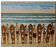
Wood Surfboards in Maryland! 1950s Postcard 14 x 9 cm / 5 1/2 x 3 1/2 in.