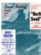
North Well 1963 Vintage surfing movie poster (Grant Rohloff) 21,5 x 28 cm / 8 1 / 2 X 11 in.