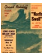
North Well 1960s Vintage surfing movie poster (Grant Rohloff) 28 x 21,5 cm / 11 X 8 1 / 2 in.