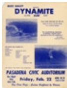
Dynamite 1962 Vintage surfing movie poster 21,5 x 28 cm / 8 1 / 2 X 11 in.