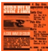
A Cool Wave of Color 1964 Vintage surfing movie poster 18 x 19 cm / 7 x 7 1 / 2 in.