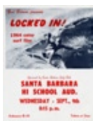
Locked in 1963 Vintage surfing movie poster (Bud Browne) 21,5 x 28 cm / 8 1 / 2 X 11 in.