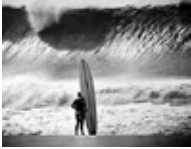
Greg Noll at Pipeline 1964 Photography 51 x 61 cm / 20 X 24 in. Signed by John Severson