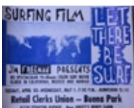
Let There Be 1963 Vintage surfing movie poster (Jim Freeman) 28 x 35,5 cm / 11 x 14 in.